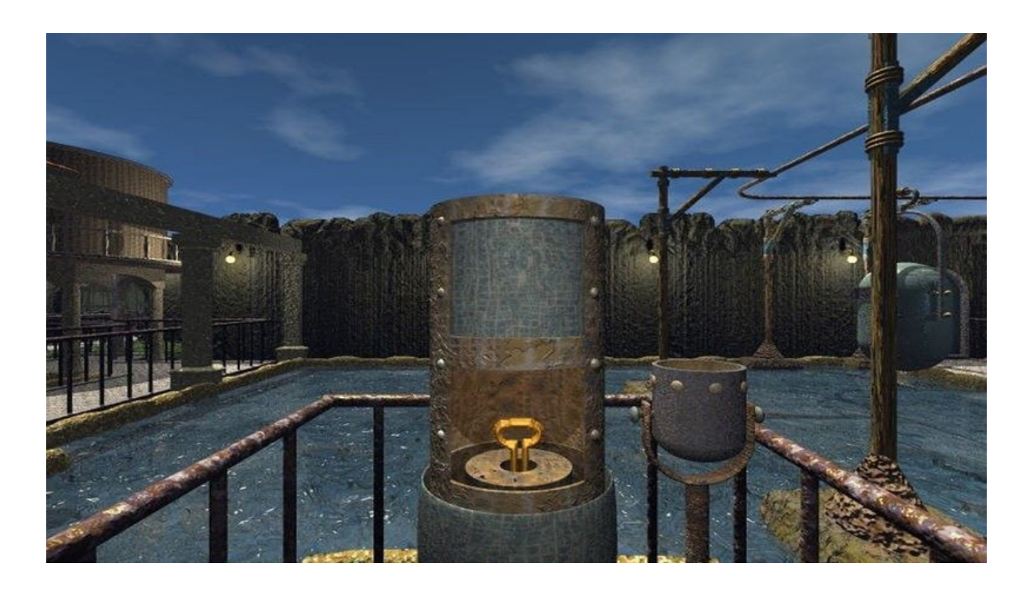
Space - The Return Of The Pixxelfrazzer Activation.rar

Download ->->-> <a href="http://bit.lv/2SH3okk">http://bit.lv/2SH3okk">http://bit.lv/2SH3okk</a>